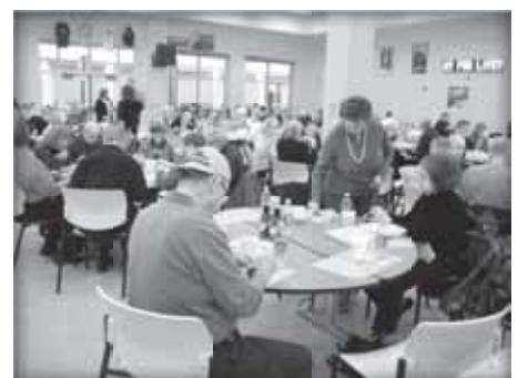
Just part of the crowd.