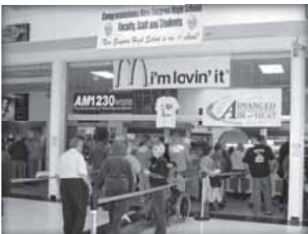
The serving line.