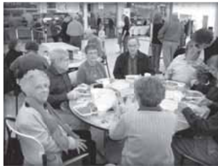
A mini class reunion - class of '48.