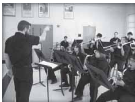
The NSBHS jazz band drew raves from the crowd!